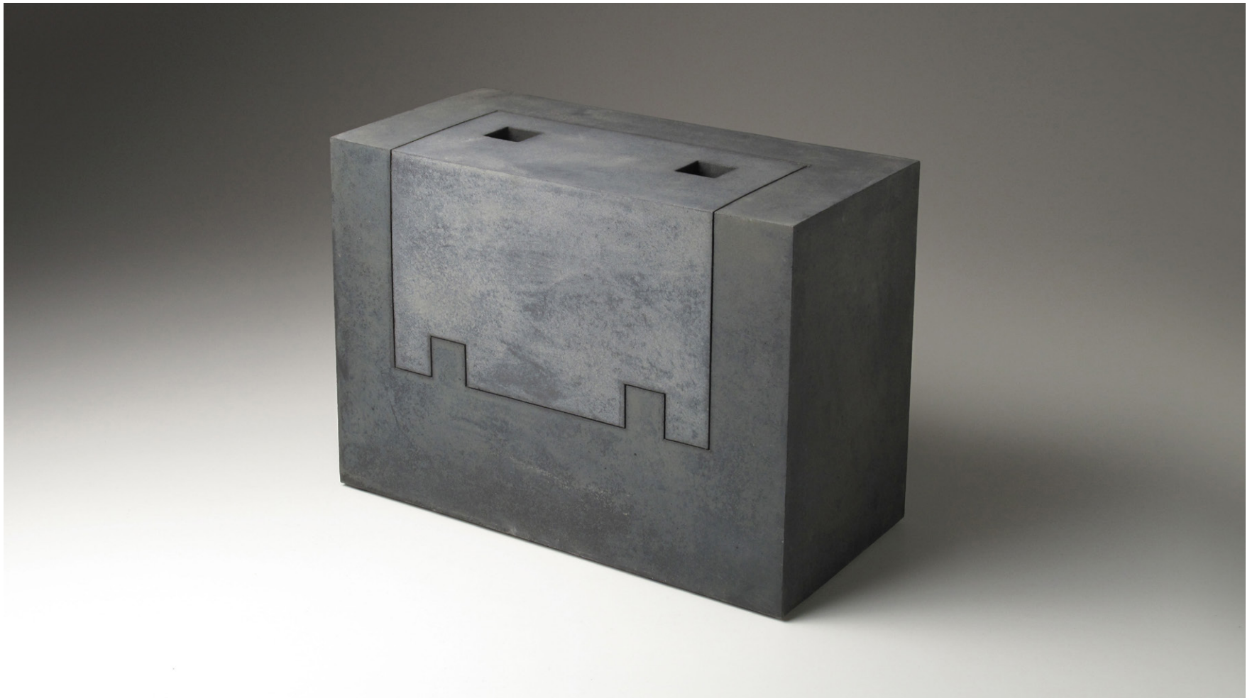
2007 Stoneware sculpture 26 x 37 x 18 cm 6.000 €