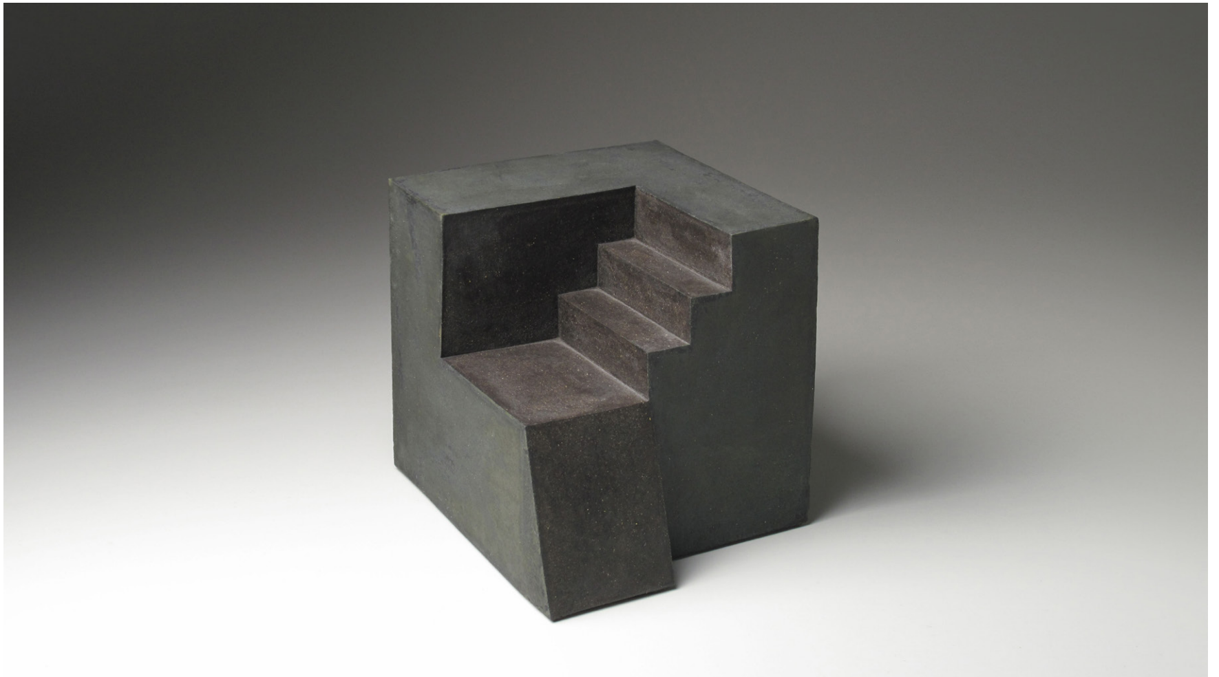
Stoneware sculpture 21 x 21 x 24 cm 4.500 €