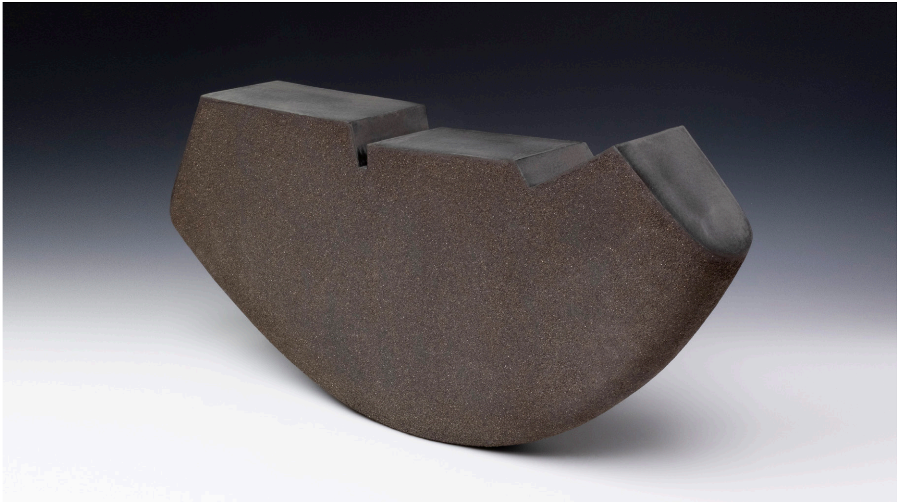
2015 Stoneware sculpture 73 x 34 x 13 cm 8.500 €